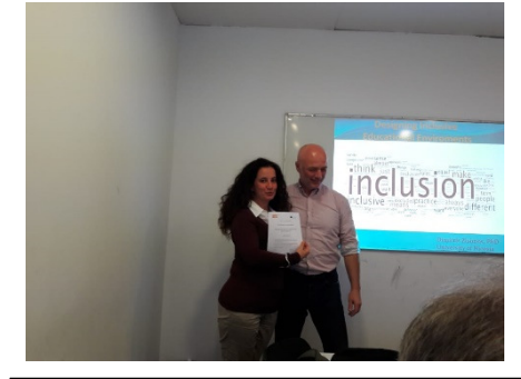
Certificate of attendance cerimony.

Coming to spare time, in addition to the scheduled sightseeing tour of Barcelona, we spent one late afternoon in the old barrio Gracia, the most independent and bohemian barrio of the city,